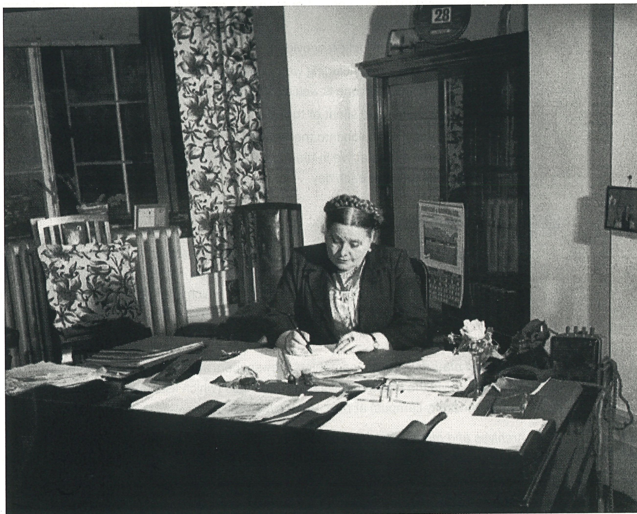
New Zealand Minister of Health Mabel Howard in her office. 28 June 1949 [E.J. and Mabel Howard papers, MS-0980/286].