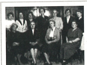
Family Planning conference, 1951