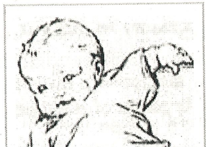
'Family planning means ...'