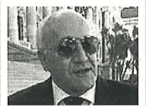
The Ngāi Tahu claim settled