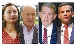
Big talk of big cuts on campaign trail ahead of first debate

In the debate, the pair took part in quick-fire rounds to show Kiwis where they stand on popular topics – with both agreeing on some key issues.