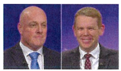
What Chris Hipkins, Christopher Luxon admire about each other