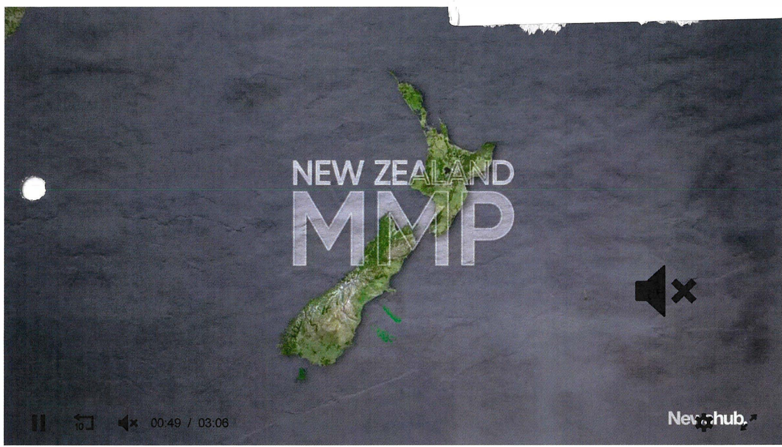
Related video: Newshub breaks down what you need to know for election 2023. Credits: Images - Getty Images; Video - Newshub.

Prime Minister Chris Hipkins and National leader Christopher Luxon may be on opposing political parties, but when it comes to some of the country's most popular issues the pair, for most, seem to be in agreement.