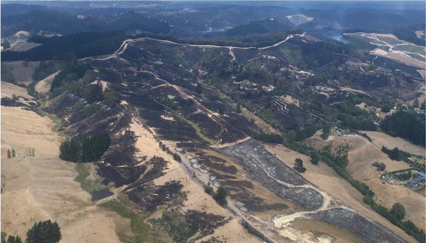
The report said the fire was initially sparked by an agricultural contractor discing a rocky paddock.