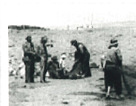
Fishing at Lake Ferry