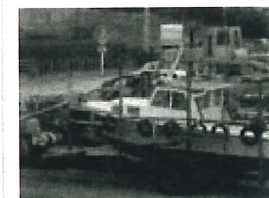
Ngāwī (1st of 2)