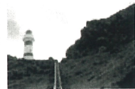
Cape Palliser lighthouse