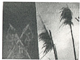
Monument at Ōrākau