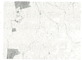
Māori land ownership, 1860 (1st of 2)