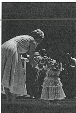
< http://blog.tepapa.govt.nz/wp-content/uploads/2010/12/ct-045267-fiji-royal-tour-1953-brake-brian.jpg > CT.045267 Fiji - Royal Tour 1953 by Brian Brake. Gift of Raymond Wai-man Lau. Te Papa

The Queen's first port of call in New Zealand was Auckland. According to one newspaper, the day she arrived 'was the best day in Auckland's history' .