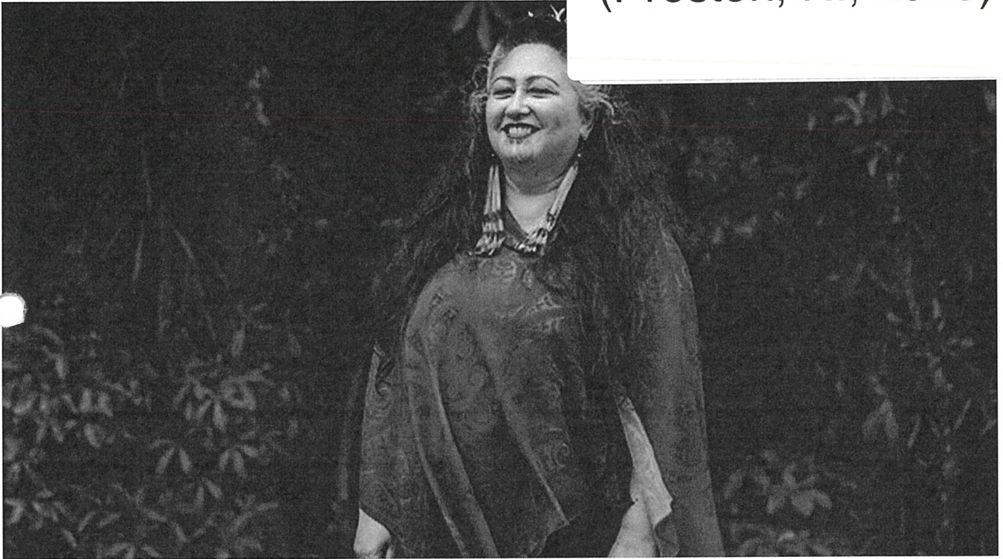
New Green Party MP Elizabeth Kerekere campaigned on issues facing the rainbow community.