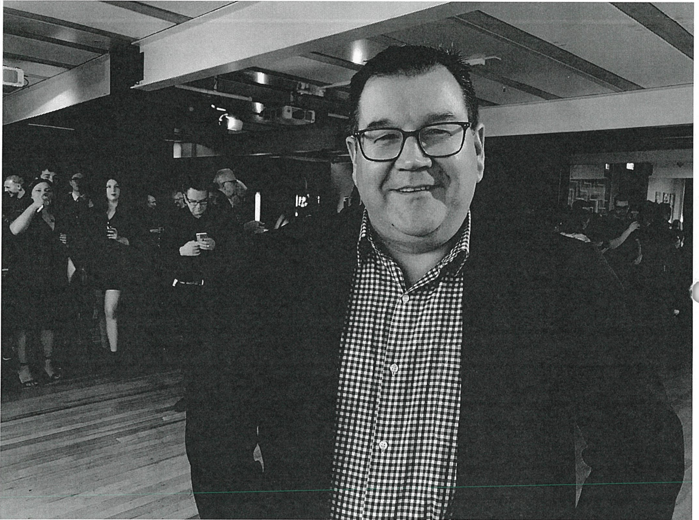
Grant Robertson enjoyed election night at Labour's HQ in Wellington's Wharewaka.

current title of the most rainbow Parliament with a 7 per cent representation.