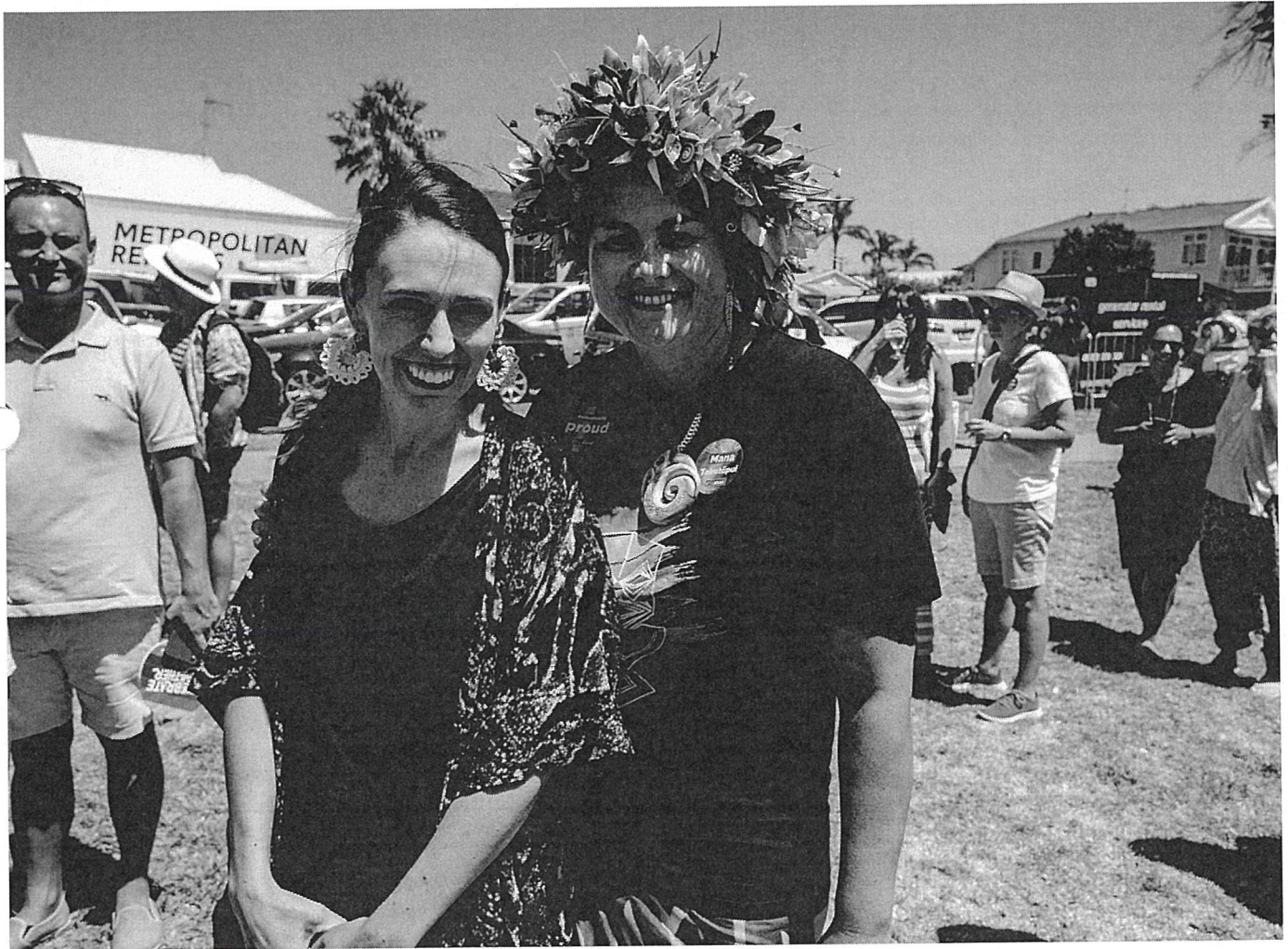
Jacinda Ardern and Louisa Wall at the Big Gay Out in Point Chevalier in Auckland in February.

They will be joined by openly LGBTQIA+ Green Party member and spokeswoman for Rainbow issues Jan Logie, Chloe Swarbrick, Elizabeth Kerekere and Ricardo Menendez. About 40 per cent of the Green Party MPs are also from the rainbow community.