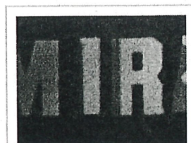
Billboard, Wellington airport, 2004