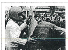
Protestors and rugby fans in conflict, 1981

When, at the request of the United States, the New Zealand government sent troops to fight in the Vietnam War, widespread protest erupted on the streets. Some proposed that New Zealand assert itself as a small independent country with a role as peacemaker in the age of nuclear warfare. This vision grew during the 1970s and early 1980s with protests against visiting American nuclear ships, and climaxed when New Zealand became nuclear free in 1985. In that year Prime Minister David Lange won the argument for an anti-nuclear world at the Oxford Union Debate, presenting a very different stance from the traditional, triumphant hero of the battlefield. Since 1985 New Zealanders have served as peacekeepers, travelling to trouble spots in the Pacific, Europe, Africa and the Middle East.