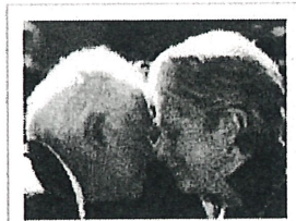
Silvia Cartwright is sworn in as governor general

As late as 1975 a book entitled The New Zealanders featured an image of the All Black rugby forward Colin Meads carrying a sheep under each arm. But this stereotype was being challenged. The catalyst was the attempt to isolate South Africa for its apartheid policies. In 1973 Prime Minister Norman Kirk cancelled a proposed tour by South