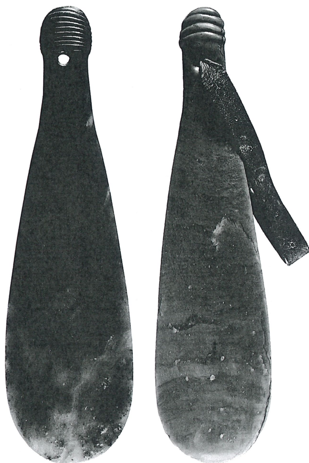
Fig. 5 Mere pounamu (greenstone clubs). Without documentation, the provenance of these two objects cannot be verified, but they are probably those given to William IV by Titore and Patuone (Royal Collection, St James's Palace; A, 62810; B, 62811; © The Royal Collection, HM Queen Elizabeth II; reproduced with permission from the Royal Collection Picture Library).

cloaks as presentations, as they had been photographed with them on formal occasions, and such gifts were likely to have been stored safely. In the case of mere, which are relatively indestructible and made of a precious substance (nephrite), there was a good possibility that at least some of those presented to members of the royal family would have survived, especially if they were accompanied by historical documentation, such as registers. The case for the Titore mere was particularly interesting to me as the circumstances of its presentation and the clear evidence that it had been received was beyond question. What then, might have become of it?