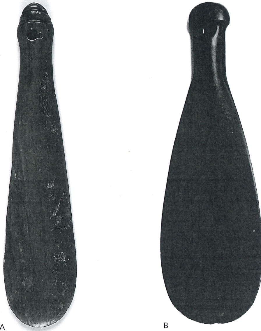
Fig. 6 Two mere pounamu (greenstone clubs) originally in the possession of Captain William Hobson. One of these was presented by Patuone on 6 February 1840 and intended for Queen Victoria. A, 'mere pounamu with three grooves on butt, pre-European drilled hole. Pale green, 15 inches, greatest width 3.5 inches' (Te Papa ME 010819); B, '19th century, dark green with paler flecks, with a fairly thin blade and a slight chip on the top edge, the butt without ridges and a bi-conical perforation' (Waitangi National Trust WNT1961/1/1; reproduced with permission).

or Eruera Maihi) had joined the party invited to dine with the officers of the Herald (he could understand English but did not speak it). The old chief now presented a further mere pounamu for Queen Victoria as a token of submission to her authority. Mathew wrote: