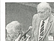
Council of Trade Unions leaders