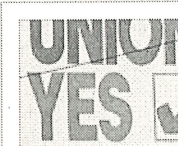
Trades Hall and 'Union Yes' sign