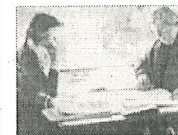
Challenging the Pātea freezing works closure