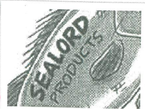
Sealord Products (1st of 3)

continue to take fish and other seafood for personal consumption and traditional gatherings.