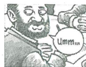
OECD and New Zealand