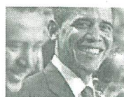
G20 leaders in London, 2009