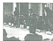
Walter Nash, Bretton Woods, 1944