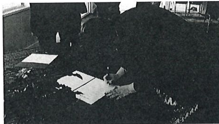
Private sector businesses sign MOU with Te Puea Memorial Marae (/news/regional/private-sector-businesses-sign-mou-te-puea-memorial-marae)