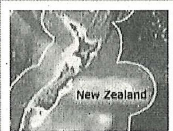
Pacific Island Exclusive Economic Zones