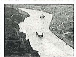
The Panama Canal