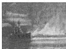
'Evacuation from Salonica'

The failure of the August offensive created doubts in London about the campaign, especially as the Western Front was assuming importance. General Sir Ian Hamilton, who was in charge of the British forces at Gallipoli, wanted more men. Opinion was against him. General Sir Charles Monro replaced him in mid-October and soon proposed evacuating the troops. Appalling weather conditions sealed the issue. A storm swept through the peninsula in late November. Water flooded the trenches and drowned men and drenched everything. The snow that followed left many dead from exposure. Survivors from both sides were miserable. In London, the authorities reluctantly agreed to a withdrawal.