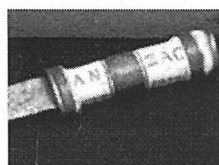
Anzac Jack knife and case

Left behind were the dead: 87,000 Turks and 44,000 British and French, including 8700 Australians and 2721 New Zealanders. The wounded numbered in the hundreds of thousands, perhaps as many as 160,000 Turks and up to about 100,000 British allies, including 20,000 Australians and nearly 5000 New Zealanders.