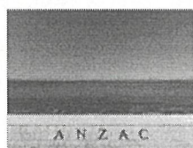
Anzac commemorative site panorama, Gallipoli

The numbers belie the rough parity of the two sides during the campaign. Thirteen Allied divisions faced a roughly comparable Turkish force of 14 divisions, which had the advantage of operating on the interior lines of their homeland. The Allied build-up was always too little, too late. Inadequate leadership played a part in the Allied failure too, and it is clear that the British seriously underestimated the strength of the Turkish defenders and the ability of their leaders.