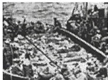
Evacuation of wounded

The failure of the August offensive created doubts in London about the campaign, especially as the Western Front was assuming importance. General Sir Ian Hamilton, who was in charge of the British forces at Gallipoli, wanted more men. Opinion was against him. General Sir Charles Monro replaced him in mid-October and soon proposed evacuating the troops. Appalling weather conditions sealed the issue. A storm swept through the peninsula in late November. Water flooded the trenches and drowned men and drenched everything. The snow that followed left many dead from exposure. Survivors from both sides were miserable. In London, the authorities reluctantly agreed to a withdrawal.