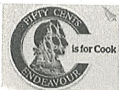
James Cook stamp

Serious British interest in the Pacific is generally considered to have begun only in the mid 1760s. Following John Byron and Samuel Wallis's earlier expeditions, in 1768 James Cook set out for Tahiti to observe the transit of Venus. The expedition was then to establish the eastern tip of Tasman's New Zealand and the Australian coastline. While the goals of the voyage were scientific, the British also wished to expand trade and empire, and Cook would be careful to include information on resources and the suitability of land for settlement.