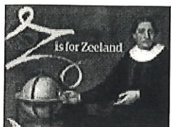
Abel Tasman stamp

There was speculation that a terra australis incognita (unknown southern land) existed, but European presence in the Pacific remained well north of New Zealand before the mid 17th century.