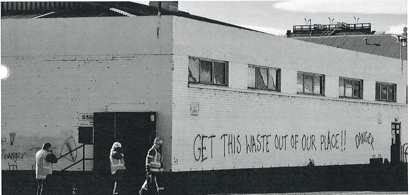
Firefighters at an entrance to the building holding toxic ouvea premix in Mataura.

Regions (/regions) > Southland (/regions/southland) > Southland (/regions/southland/government-backs-dross-action#comments)