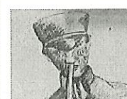
Native constable, 1850