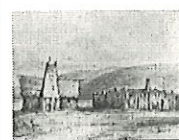
Police stockade, 1849