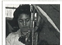
Working in a box factory

During the Second World War, Māori women, like their Pākehā counterparts, took a role in running farms and increasingly in working in factories. While fewer than 50 Māori women were working in industry in 1926, the number increased tenfold by 1945 to around 500. This began the increasing urbanisation of Māori.