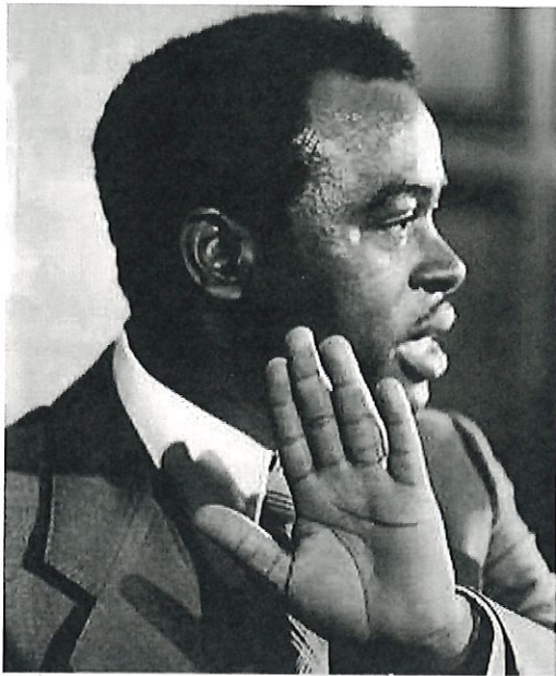
Maj. Gen. Olufemi Olutoye, then-president of the Nigerian Olympic Committee, announces his country's withdrawal from the Montreal Olympics in Montreal on July 16, 1976.

montreal-olympics-days-before-opening-ceremony-city-was-a-nervous-wreck ).