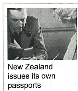
New Zealand issues its own passports

Naturalisation could still be revoked for misrepresentation, and now also if a citizen had 'shown himself by act or speech to be disaffected or disloyal to His Majesty'. (Disloyalty remained grounds for deprivation of citizenship until 1959.) The definition of British nationality was brought into line with that in the United Kingdom.