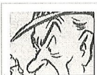
Nordmeyer's sin taxes