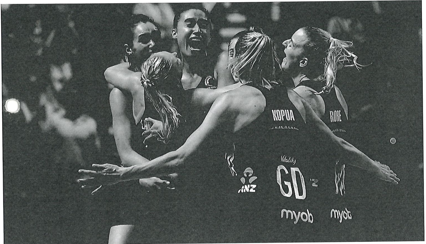
The Silver Ferns celebrate after the final whistle. Credits: Photo - AAP; Video - Sky Sports

The Silver Ferns have won the 2019 Netball World Cup after beating Australia 52-51 in a tense final in Liverpool on Monday (NZ time).