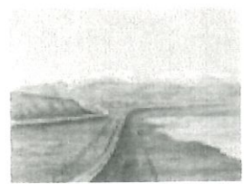
Main trunk line

A 3rd careful management of the national finances set the economy up for the long boom in the mid-1890s. Prices fell during these years, so for people with jobs the ability to