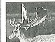
Fallow deer stags