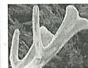
Wapiti (North American elk)