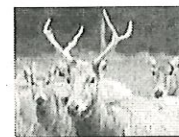
Père David deer