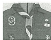
Scout shirt badges