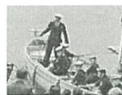
Sea Scouts, Wellington, 1951