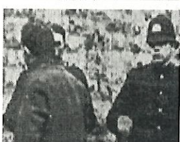
Christchurch tramways strike, 1932