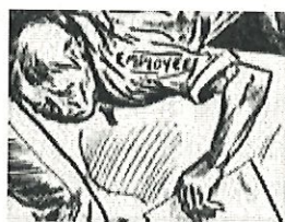
Lamponing the Arbitration Court

The 1935 Labour government extended the arbitration system to cover many more workers, including office workers and government employees. Nationwide unions became legal, and union membership was compulsory – any worker covered by an agreement negotiated by a registered union had to join that union. Union membership increased rapidly under this new system, until nearly half of all workers belonged to a union. Compulsory arbitration was reinstated in 1936. A new Federation of Labour was set up. The short-lived first Federation had disappeared after the disastrous 1913 Great Strike.