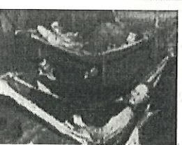
Freezing workers' stay-in strike, 1937