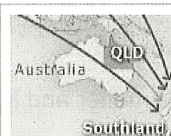
New Zealand in the international aluminium industry