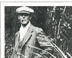
Aluminium entrepreneurs, 1928