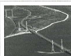
Tiwai Point aluminium smelter

New Zealand's Bluff aluminium smelter produces the world's purest aluminium. It is used in mobile phone and computer chips, and, because of its strength and lightness, in very large passenger planes.