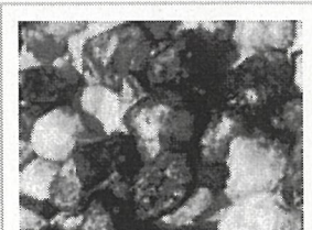
Loading possum bait