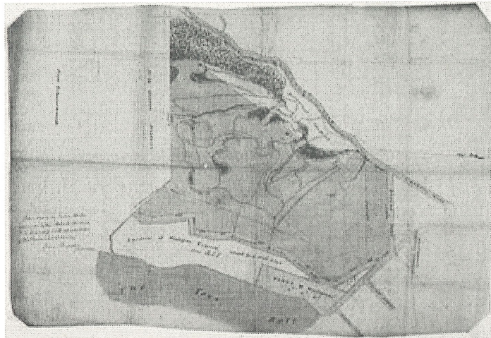
Map of the Colonial Botanic Garden, about 1875

Hector eventually retired in 1903, having championed science and New Zealand tirelessly and led the scientific community - sometimes controversially - for forty years. The portrait of Sir James Hector, painted after his death in 1945, is on display in Te Papa's library, Te Aka Matua Library & Information Centre (Level 4).