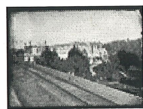
Colonial Museum, Circa 1880 Made by James Bragge, Wellington black and white collodion glass negative Purchased 1955