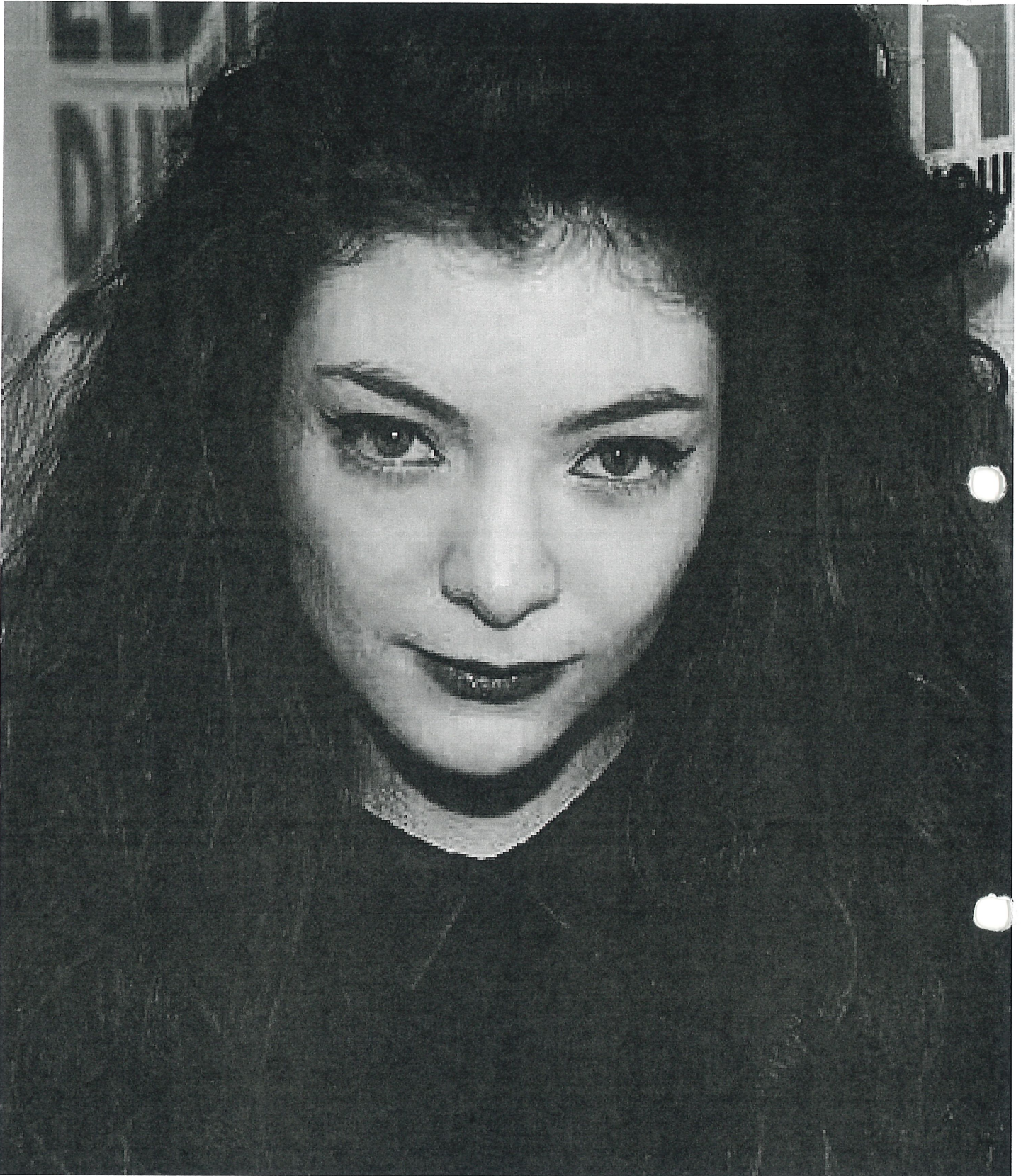
TOP OF THE POPS: Singer-songwriter Lorde

It's been billed as the biggest moment in Kiwi music in 25 years. Michelle Duff reports on Lorde's ascension to pop music's throne with her No 1 hit Royals.