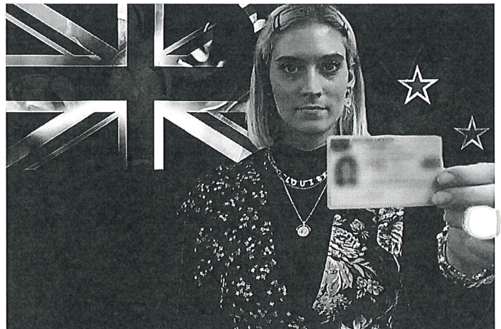
Millions of Kiwis Secured Funeral Insurance - Here's Why?