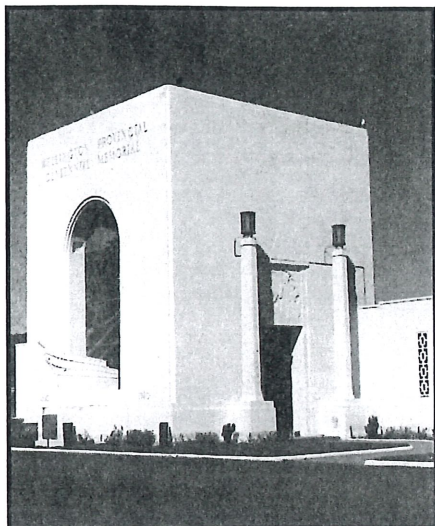
Wellington Public Library

The painting, along with the building, subsequently fell into disrepair and was painted over in the late 1970s, at about the time the building was refurbished and converted to the Petone Settlers Museum. The only record of the original mural remaining was a series of black-and-white photographs held by the Alexander Turnbull Library in Wellington. When it was decided to commission the repainting for the 1990 commemorations, these were used as a basis, although two new panels were added.