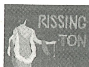
Rissington Women's Institute banner (1st of 2)