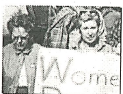
Women's Division protest