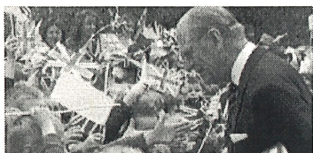
The Duke of Edinburgh