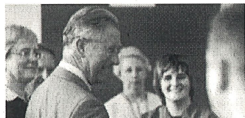
The Duke of Edinburgh

Home Her Majesty The Queen Accession and Coronation