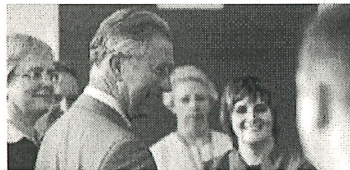
The Prince of Wales