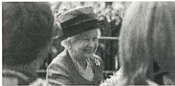
Her Majesty The Queen