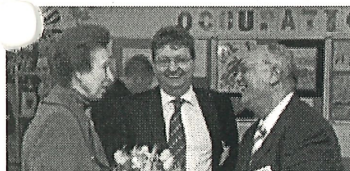
The Princess Royal