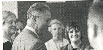
The Prince of Wales