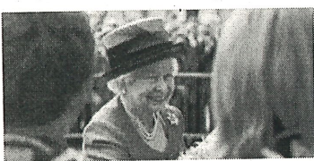
Her Majesty The Queen