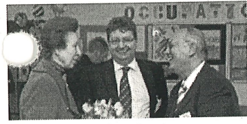
The Princess Royal

Home History of the Monarchy United Kingdom Monarchs