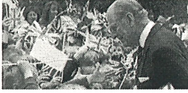
The Duke of Edinburgh