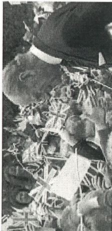
The Duke of Edinburgh