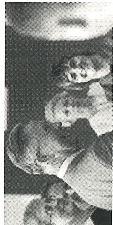
The Prince of Wales