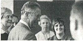
The Prince of Wales

After unveiling a First World War memorial to the Araras in Rotorua, they visited many North Island towns before arriving in Wellington.