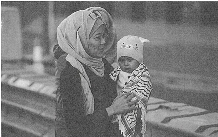
A woman and child arrive at court this morning.

White roses were handed out to the victims as they arrived in court. They were donated as a gesture of support from two women.