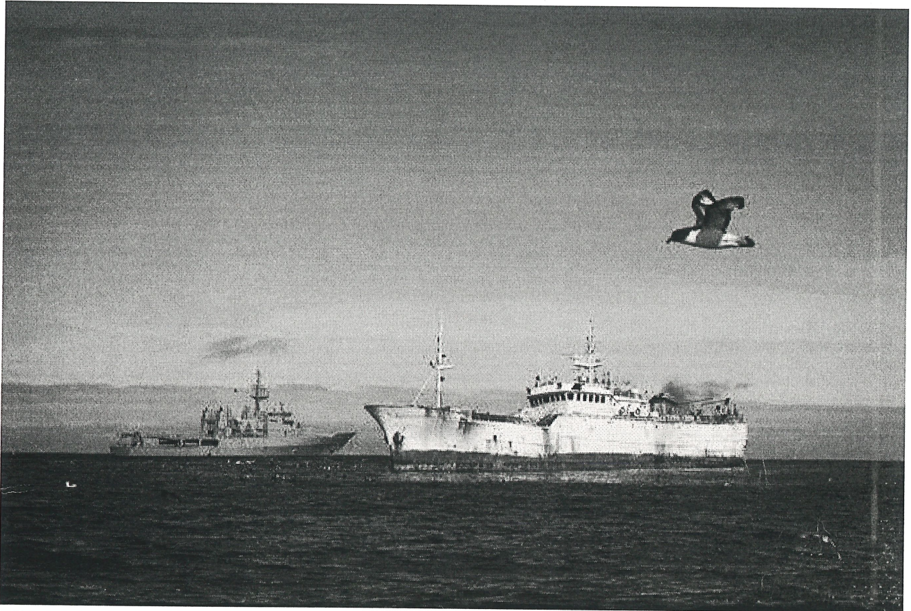
HMNZS Wellington (L) has been gathering evidence of illegal fishing in Antarctic waters.

Forcing entry onto three vessels illegally fishing in the Southern Ocean would be too dangerous, Foreign Minister Murray McCully says.