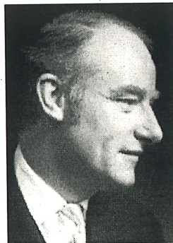
Francis Harry Compton Crick