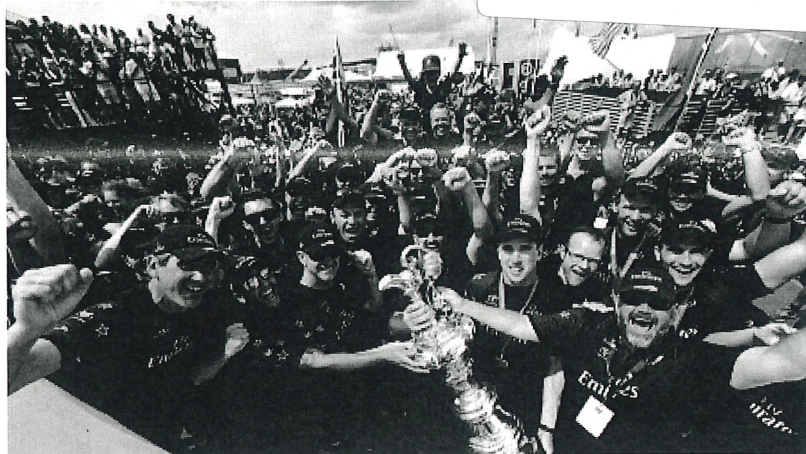
Team NZ celebrating their big win.