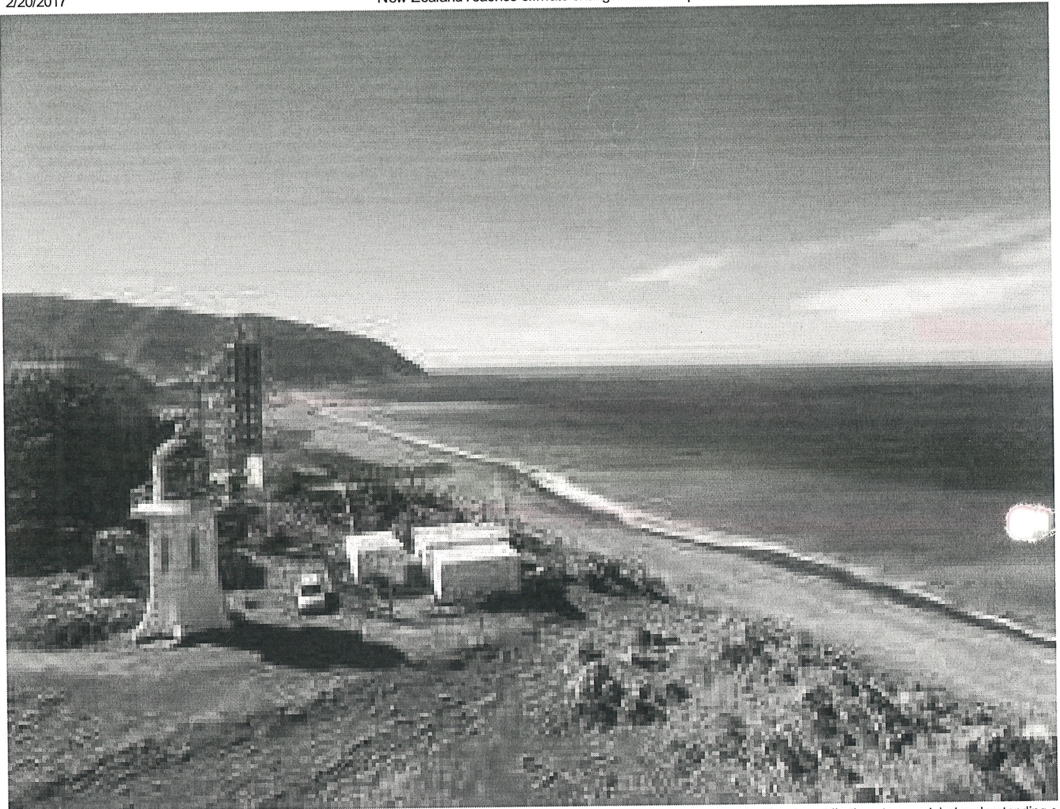
The Baring Head station, which overlooks Cook Strait, has been operating since 1972 and the data collected there makes significant contributions to our global understanding of greenhouse gases.