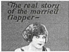
1920s movie poster

This was the era radio broadcasting began: New Zealand's first stations went on air in 1922. Gramophones and local bands blasted the latest American jazz music and dances like the Charleston became hugely popular. But the real entertainment sensation of the twenties was silent (and later 'talkie') movies. Cinema attendance exploded and palatial 'Picture Palaces' like Dunedin's Empire De Luxe and Auckland's Civic were opened.