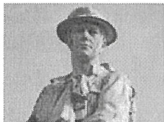
Kaipoi war memorial

The Great War cast a long shadow over the 1920s, leaving deep emotional scars. Few New Zealanders had not lost a relative, friend, workmate or neighbour. Many people yearned to contact lost loved ones, sparking an upsurge of interest in spiritualist beliefs. The influential Returned Soldiers' Association lobbied the government to make Anzac Day a sacred, 'Sundayised' holiday, helping to turn war remembrance into a 'civil religion'.