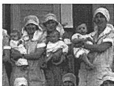
Karitane nurses 'babies in 1929

New Zealand's population grew steadily during the decade, climbing from about 1.24 million in 1920 to 1.48 million in 1930. Despite the deaths of 18,000 soldiers during the Great War, the country still had slightly more men than women. Following the revival of assisted immigration from Britain, more than 120,000 migrants arrived from the UK between 1919 and 1930, including 13,000 ex-servicemen and their families. But economic uncertainty meant New Zealand wasn't always a promised land; nor were these so-called 'Homies' always welcomed by locals.