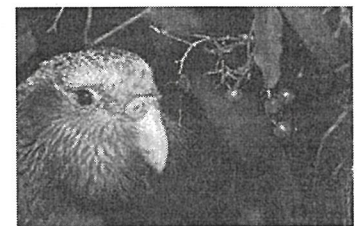
Kakapo eating supplejack berries

Sometimes a single kakapo will represent a hard day's work, and if half-a-dozen are secured, (with a kiwi and a roa), it is considered something of a feat. Once the birds are in portable knapsack cages we then have to deliver the birds to their new home in the best possible condition..."