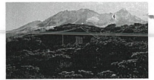
Blyth Hut and Ruapehu

Find out more about skiing on Mount Ruapehu at the Ruapehu Alpine Lifts website and the Tukino skifield website