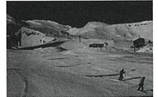
Whakapapa ski field