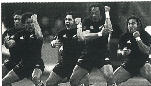
The Haka was first performed by the All Blacks in 1907

When it comes to the Haka, the northern hemisphere is infatuated on everything about it.