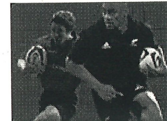
Does size matter in rugby?