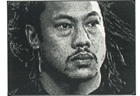
Tana Umaga's All Black magic!