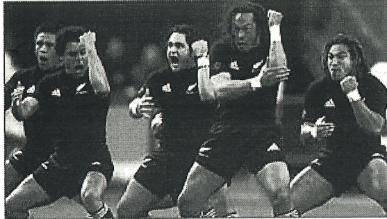
The Haka was first performed by the All Blacks in 1987

When it comes to the Haka, the northern hemisphere is infatuated on everything about it.