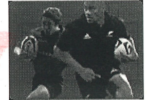
Does size matter in rugby?