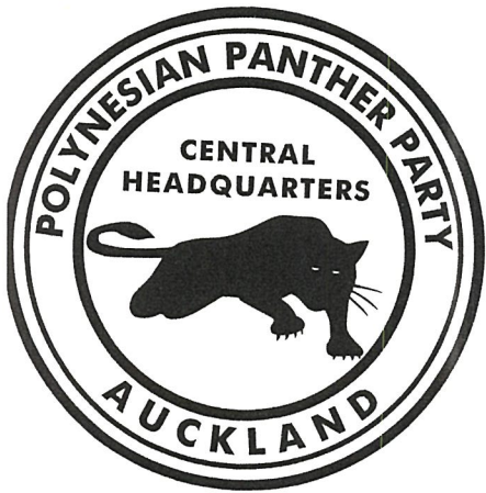
logo of the Polynesian Panthers, 1970s.

Rhetoric escalated into direct action in the form of random checks and dawn raids, conducted mainly in Auckland, when police taskforces targeted individuals who looked like Pacific Islanders or potential overstayers, regardless of their status as citizens. The police swooped on households in the early hours of the morning, often employing aggressive or intimidatory tactics. It was in response to this hostility that the Polynesian Panthers sprang into action, working at both grass roots and governmental level to expose and eradicate injustice, inequality and racism. This essay explores the circumstances that led to both the police tactics and the emergence of the Panthers.