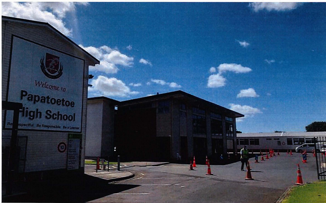
Papatoetoe High School remains closed as health authorities take the Covid-19 outbreak in the suburb.

Case G was reported on 19 February. Case H was reported on 22 February, having returned an earlier negative result, but had been in quarantine as a precaution since the 19th and in isolation since the 15th.